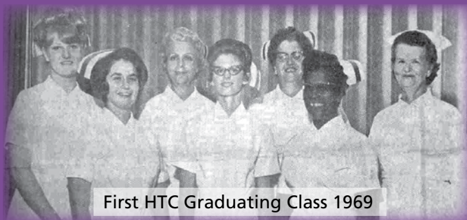
First HTC Graduating Class 1969