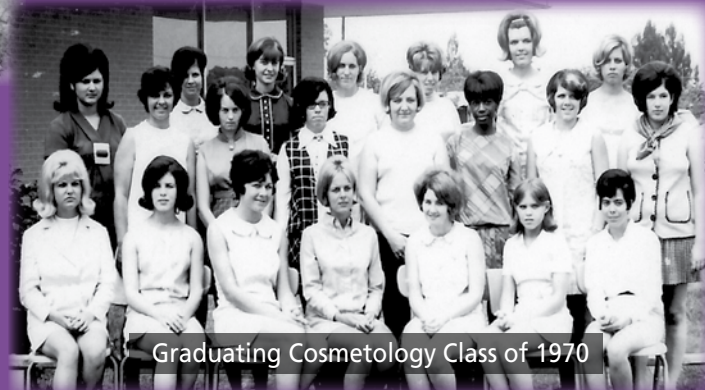
Graduating Cosmetology Class of 1970